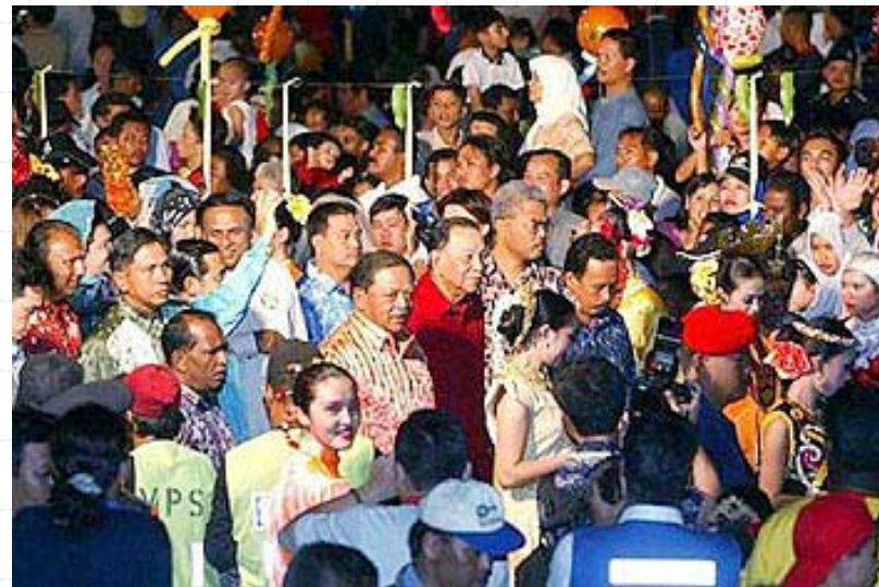
The King at the National Level Deepavali “open House”- Malaysian style.