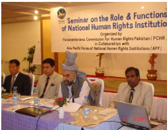
Seminar on the establishment of a national human rights commission in Pakistan.

On 28 May 2004, General Pervez Musharraf, President of Pakistan announced his intention to establish a National Commission on Human Rights. This announcement followed the submission by the Pakistan Parliamentarian’s Commission for Human Rights (‘PCHR’) of a concept paper on the establishment of a NHRI to the President, Prime Minister, Law Ministry and the leadership of the ruling party.