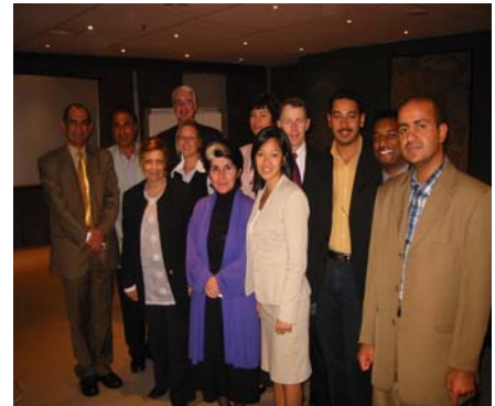
Representatives of the Ministry of Human Rights of Iraq meeting with the APF.

The APF encouraged the participation of governments and human rights NGOs in the APF's annual meetings, workshops and training programs as an important awareness raising and partnership exercise about the role and functions of NHRIs. In addition the APF received a number of visits from regional government and civil society representatives. For example, during 2005 the APF received visits from representatives of the governments of Iraq, Vietnam and Taiwan.