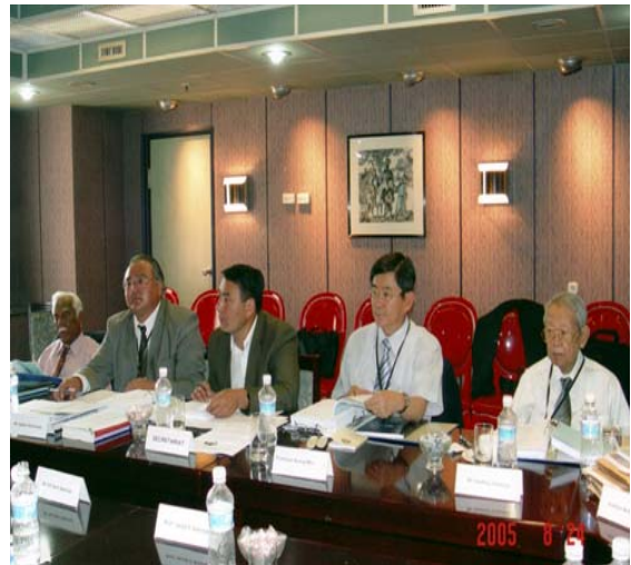
Members of the Advisory Council of Jurists meeting in Mongolia.

The APF established the ACJ in 1998. The Council advises the APF and its member NHRIs on the interpretation and application of international human rights standards. The establishment of the ACJ under the aegis of the APF is a significant advance in the protection and promotion of human rights in the region. For the first time a regional juridical body is in a position to review and assess human rights issues in the Asia Pacific region. It serves the practical purpose of providing advice to APF members on the interpretation and application of international human rights jurisprudence. This development provides a strategic framework within which to further advance the application of international human rights standards. In addition to developing regional jurisprudence on international human rights, the Council strengthens the effectiveness and capacity of NHRIs in the region.