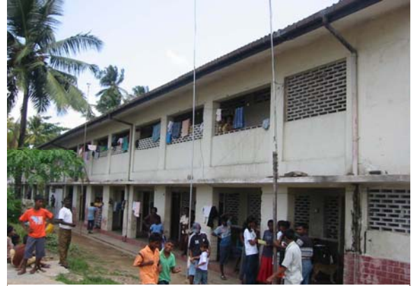
IDP Camp in the southern Sri Lankan city of Galle.

Commissioners and senior staff representatives from the NHRIs of Afghanistan, India, Indonesia, the Maldives, Nepal, the Philippines, Thailand and Sri Lanka attended the workshop. The workshop also included participants from civil society organisations from India, the Philippines, Sri Lanka, and international and regional NGOs and research institutions from Thailand, Norway and the United States. The Government of Sri Lanka also participated in the workshop, as did representatives from the UN High Commissioner for Refugees ('UNHCR'), OHCHR, UN Office for the Coordination of Humanitarian Affairs ('OCHA'), and the UN Country Team (Sri Lanka).