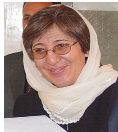
Dr Sima Samar, Chairperson, Afghan Independent Human Rights Commission.

The ACJ presented their interim report on torture.