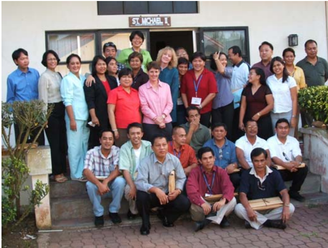
Staff from the Philippines Commission for Human Rights at the APF's Investigations Training Program.

The five-day training program was implemented from the 18 th to 22 nd April 2005 in Manila, Philippines. 24