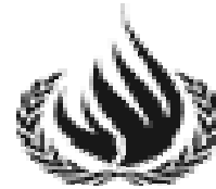
Office of the High Commissioner for Human Rights